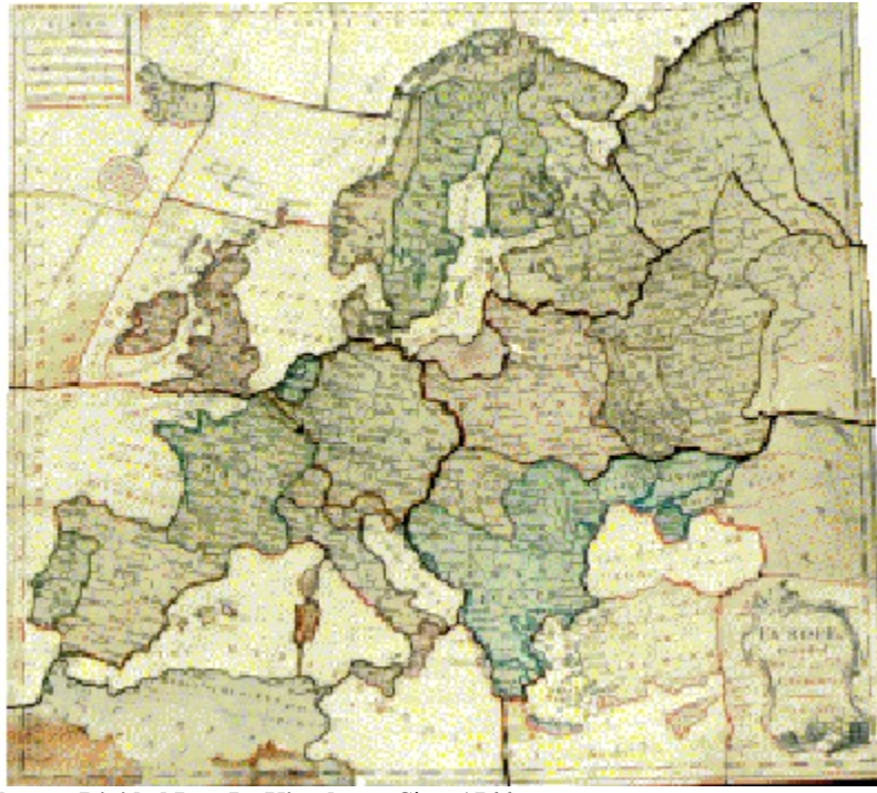
Europe Divided Into Its Kingdoms. Circa 1766. This is one of the few surviving puzzles made by John Spilsbury, acknowledged by most authorities as the inventor of the jigsaw puzzle. Spilsbury was a mapmaker in London, England. (17.75" x 19.5", 55 hand-colored wood pieces)

The first jigsaw puzzles were "dissected maps," produced by map makers as educational devices to teach geography to children. John Spilsbury of London is credited by many with inventing the jigsaw puzzle around 1762. The Amsterdam firm of Covens & Mortier also made map puzzles in the mid-eighteenth century, but researchers have not yet been able to pinpoint the exact date when they began (Bekkering & Bekkering, 1988).