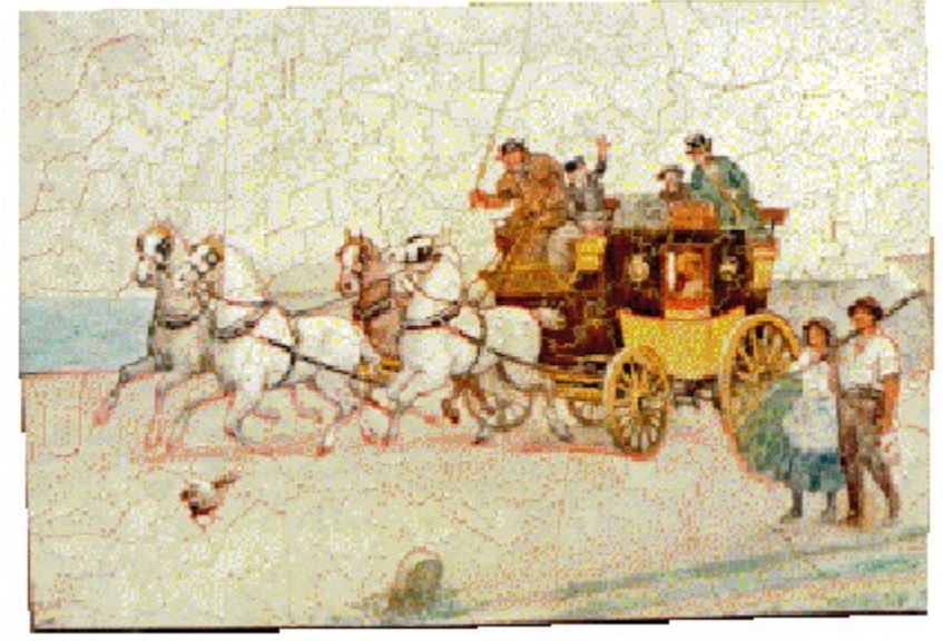
David Copperfield Leaving Margate. 1933.